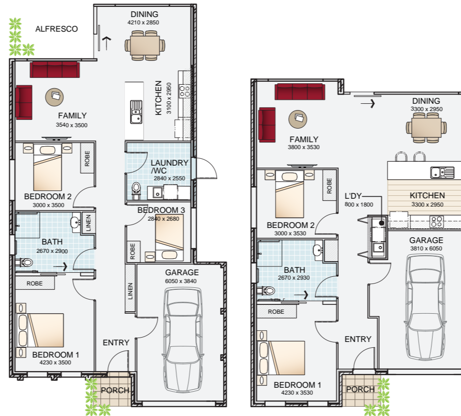
Sample 3 bedroom